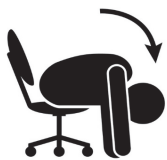
Glutes & Lower Back