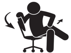
Glutes & Abductors