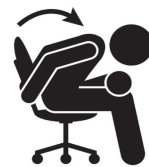
Glutes & Abductors