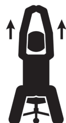
Back & Shoulder