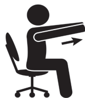
Shoulder & Upper Back